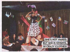
SHE'S NOT NAKED, BUT SHE IS SINGING, IN CRAZY CLOTHES!

New York Pictures By Women: A History Of Modern Photography at MoMA; until 21 March 2010; moma.org NYC's most famous gallery is celebrating female photographers, showcasing masterworks old and new, including Yoko Ono's large-scale wallpaper work entitled 'bottoms'.