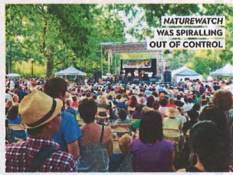
NATUREWATCH HAS SPRUNG OUT OF CONTROL