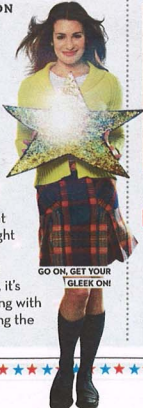
GO ON, GET YOUR GLEE ON!

Oh come all ye Glee! to worship with other Gleebs at a cool NYC club night with a twist. With episodes projected onto a giant screen, it's basically a sing-a-long with cocktails that's taking the locals by storm.