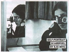
SELF-PORTRAIT IN MIRRORS, BY ILSÉ BING

New York SummerStage Gala 2010; 8 June; Central Park; $69/£48; summerstage.org After an al fresco dinner in the park, kick back and relax to the sound of acoustic acts at this top annual musical fundraiser.