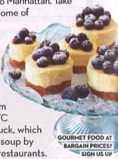
GOURMET FOOD AT BARGAIN PRICES? SIGN US UP!

New York NYC Restaurant Week 2010; July; prices vary; nycgo.com/restaurantweek The highlight of the NYC foodie calendar, this bi-annual festival ( nycgo.com/restaurantweek ) is heading back to Manhattan. Take advantage of some of the city's best eateries at rock-bottom prices ($35/£25 for three courses) or grab lunch from the mobile NYC Restaurant Truck, which sells gourmet soup by participating restaurants.