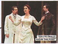
'YES! I'VE FINALLY NAILED THIS POEM!