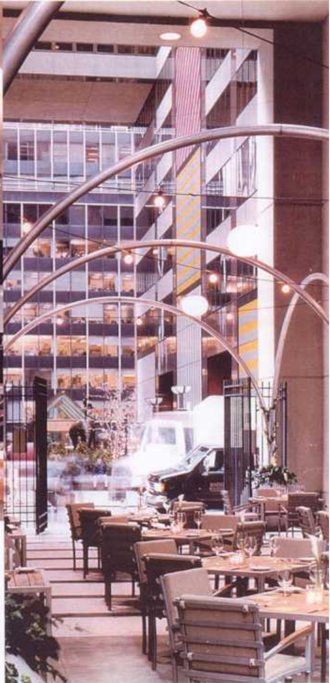
Above and right: The lounge and Moda restaurant in Flatotel in New York City. Opposite page: Washington Park restaurant in New York City.